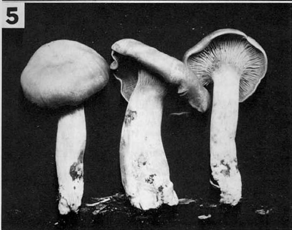
FIGS. 4-5. Omphalotus olivascens . (1/3 nat. size).